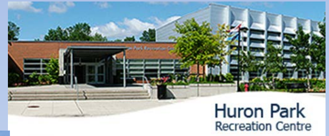
Huron Park Recreation Centre