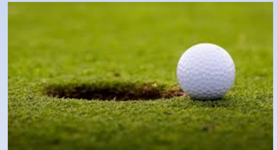
Caledon Country Club Golf