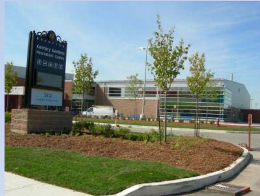
Century Gardens Bocce