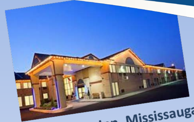
Quality Inn, Mississauga