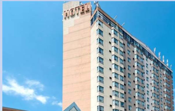
Sandman Hotel Mississauga