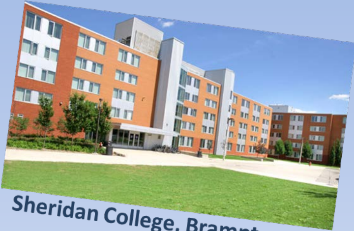
Sheridan College, Brampton