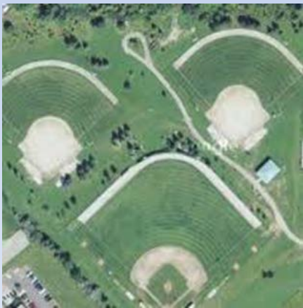
Dunton Park Softball