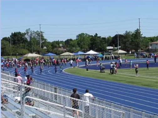
Terry Fox Stadium Athletics